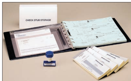
3-On-A-Page Checks: The system that simplifies check writing and record keeping.