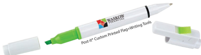
Post-it® Custom Printed Flag-Writing Tools

Demand Quality. Your Reputation Depends On it.