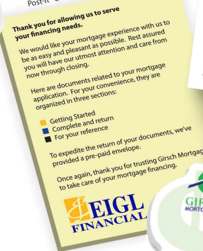
Post-it® Custom Printed Notes Shapes