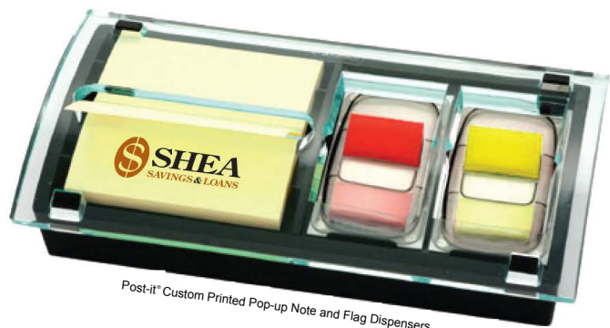
Post-it® Custom Printed Pop-up Note and Flag Dispensers