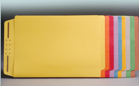
Overall + 1 3/4" Flap