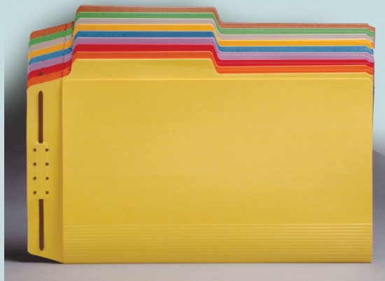
Overall + 1 3/4" Flap